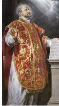
St Ignatius of Loyola